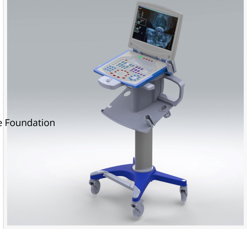
New Convertible Sonalis Ultrasound System