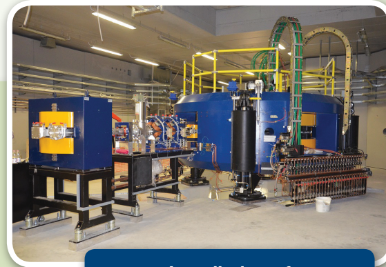
Installation of Best 70 MeV Cyclotron at Italian National Laboratories (INFN) Legnaro, Italy